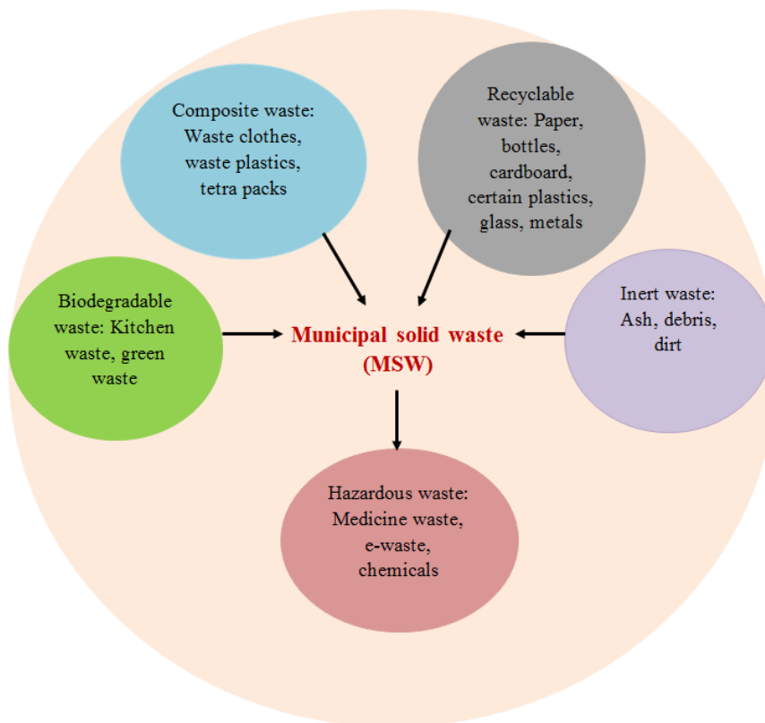
Figure 1. Msw classification