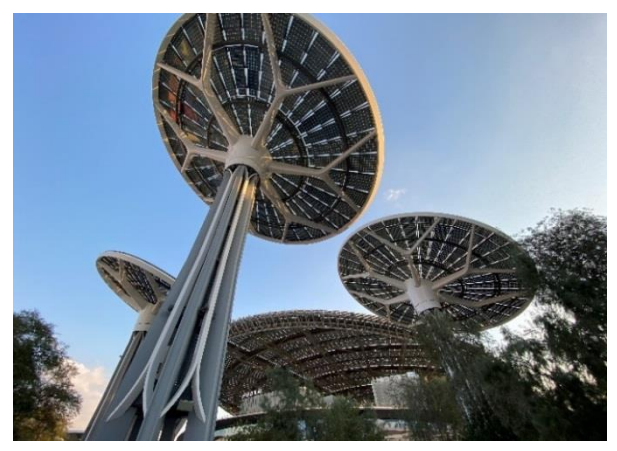
Figure 10. Energy trees that host solar panels at Expo 2020 Dubai.