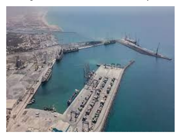
Figure 11. Saqr Port in Ras Al Khaimah [15].

There are several ideas on tidal designs that can be implemented in the UAE, and this depends on the chosen area for the tidal feasibility. The tide statistics were taken over years in 33 different locations within the UAE by the National Centre of Metrology and Saqar Port in Ras Al Khaimah UAE (Figure 11) was chosen in this study due to: