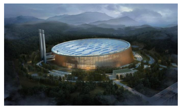
Figure 3. Architect's design of Shenzhen East WtE plant [9].

WtE is a process of getting electricity or heat from the treatment of waste using different technologies such as incineration, de-polymerization, and gasification. The Shenzhen East WtE plant in China is considered the biggest WtE plant in the world with a total capacity of 165 MW and treating 5600 of solid waste annually (Figure 3). The UAE launched different WtE projects, one of them in Al Warsan, Dubai, with the capacity of 20 MW more.