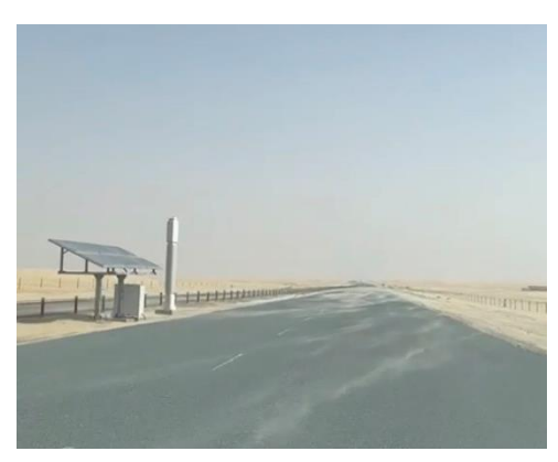
Figure 9. Solar-powered speed control camera in Abu Dhabi.