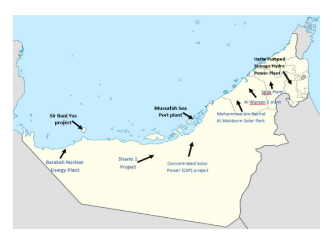
Figure 7. Locations of current renewable energy projects in the UAE.