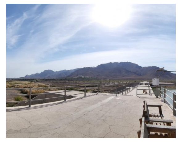
Figure 4. Hatta dam in Dubai.

A hydro energy power plant converts the energy of the water that flows through the turbines, and normally it happens due to gravity. There are 3 main types of hydro plants: diversion, pumped impoundment storage. and [10]. The impoundment is the common type, which uses a dam to store a flowing water in a reservoir and pumping it back through the hydroelectric turbines. The diversion type creates a canal in a flowing river to divert the water into the hydro power plant and the last type, pumped storage that uses battery or storage as water is pumped to a higher-level reservoir on the low demand periods, and it is pumped back again to a lower reservoir through turbines on the high demand periods. The similar plant was made in Hatta Dam, UAE, with a total capacity of 250 MW (Figure 4). There are also another types such as point absorber and surge flaps but they are more on energy harnessing that utilizes the surge motion of waves to generate electrical power [11].