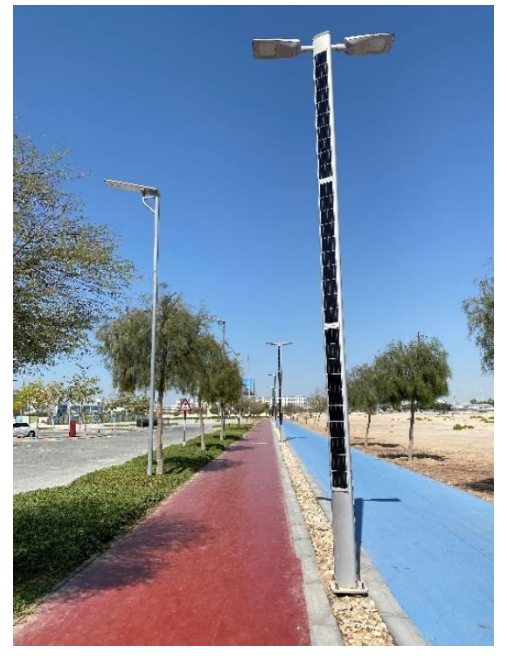
Figure 8. Solar-powered LEDs at Masdar city.